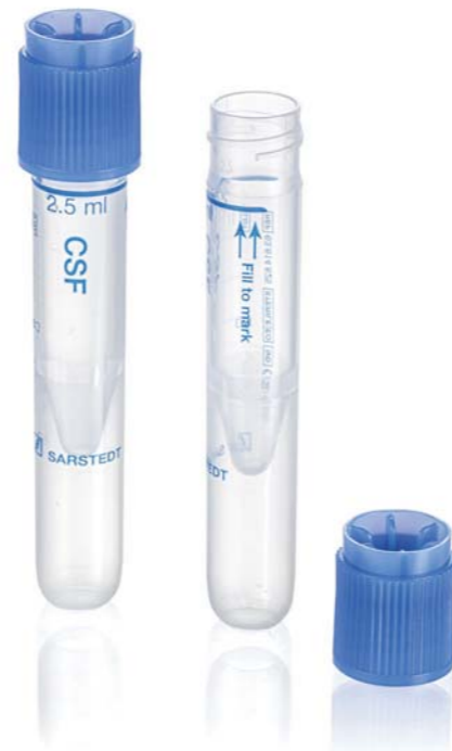
CSF false-bottom tubes

The new CSF false-bottom tubes create the perfect conditions for reliable pre-analytics to support the current development in research, diagnostics and treatment of Alzheimer’s disease.