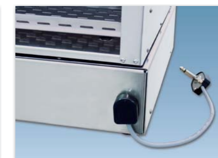
Motion detector connection (on the back)