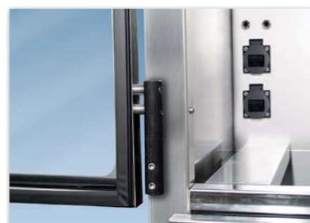
Agitator connections and door hinge